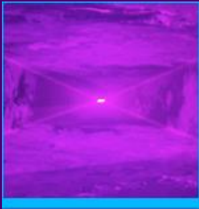
1 DARQ POWER