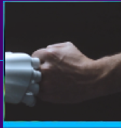
3 HUMAN+ WORKER